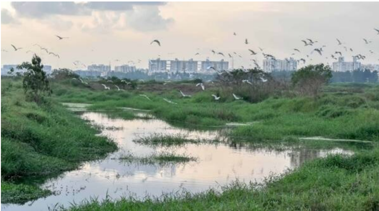
Varthur Lake

Finally, the citizens took up the cudgels to protect the lake and in June 2018, the National Green Tribunal (NGT) constituted a monitoring committee under former Lokayukta Justice Santosh Hegde to oversee the implementation of directions related to the rejuvenation of the Varthur Lake.