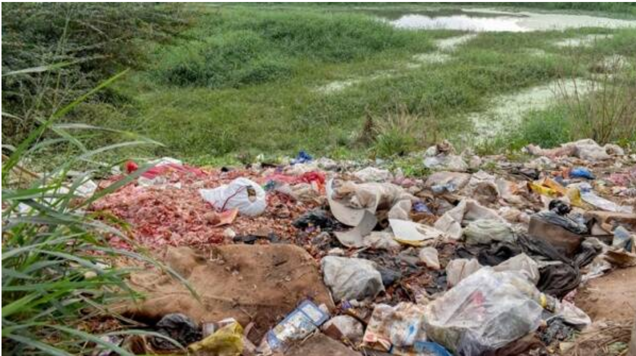
Heap of garbage near Varthur Lake

However, experts have pointed out that the restoration work slowed down considerably after the monitoring committee was dissolved.