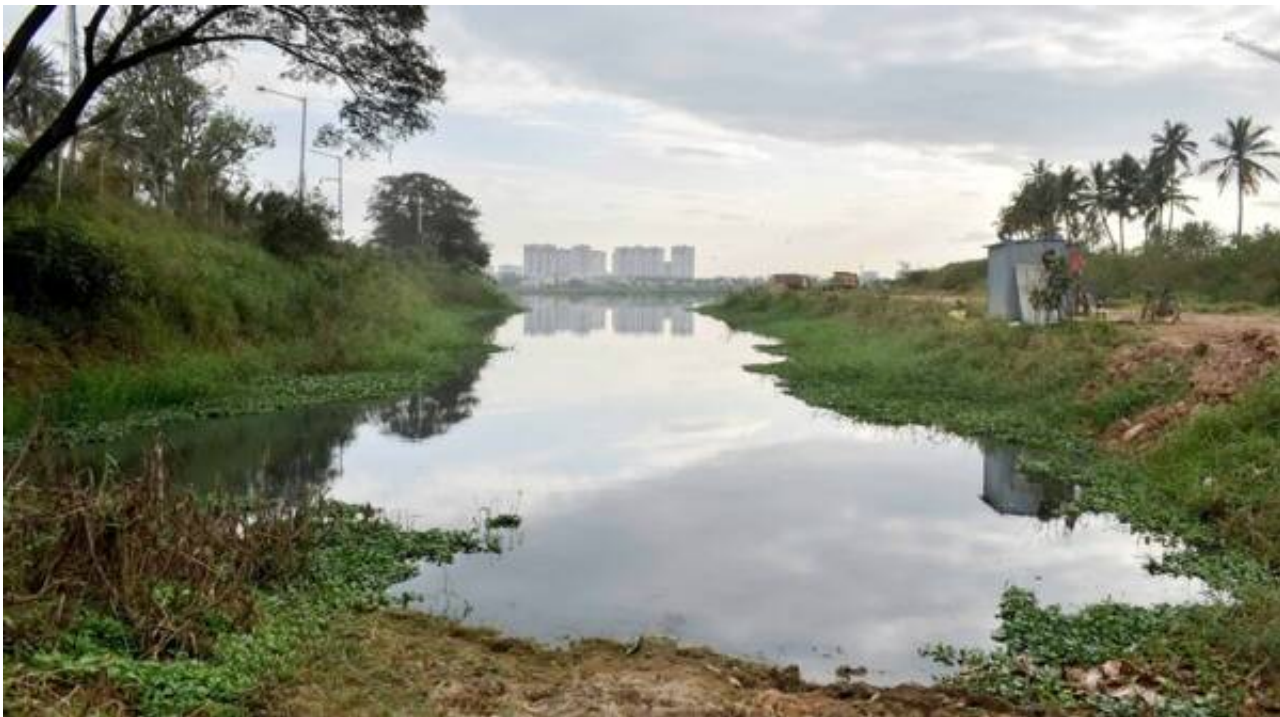
Varthur Lake

The pipeline was meant to pump treated water to tanks in Kolar. The now-defunct Karnataka Lake Conservation and Development Authority's (KLCDA) permission was not sought before the construction of the road and the laying of the pipeline. Although the NGT has ordered the department to remove the pipeline, officials said requesting anonymity that no plan to remove the pipeline has been made yet.